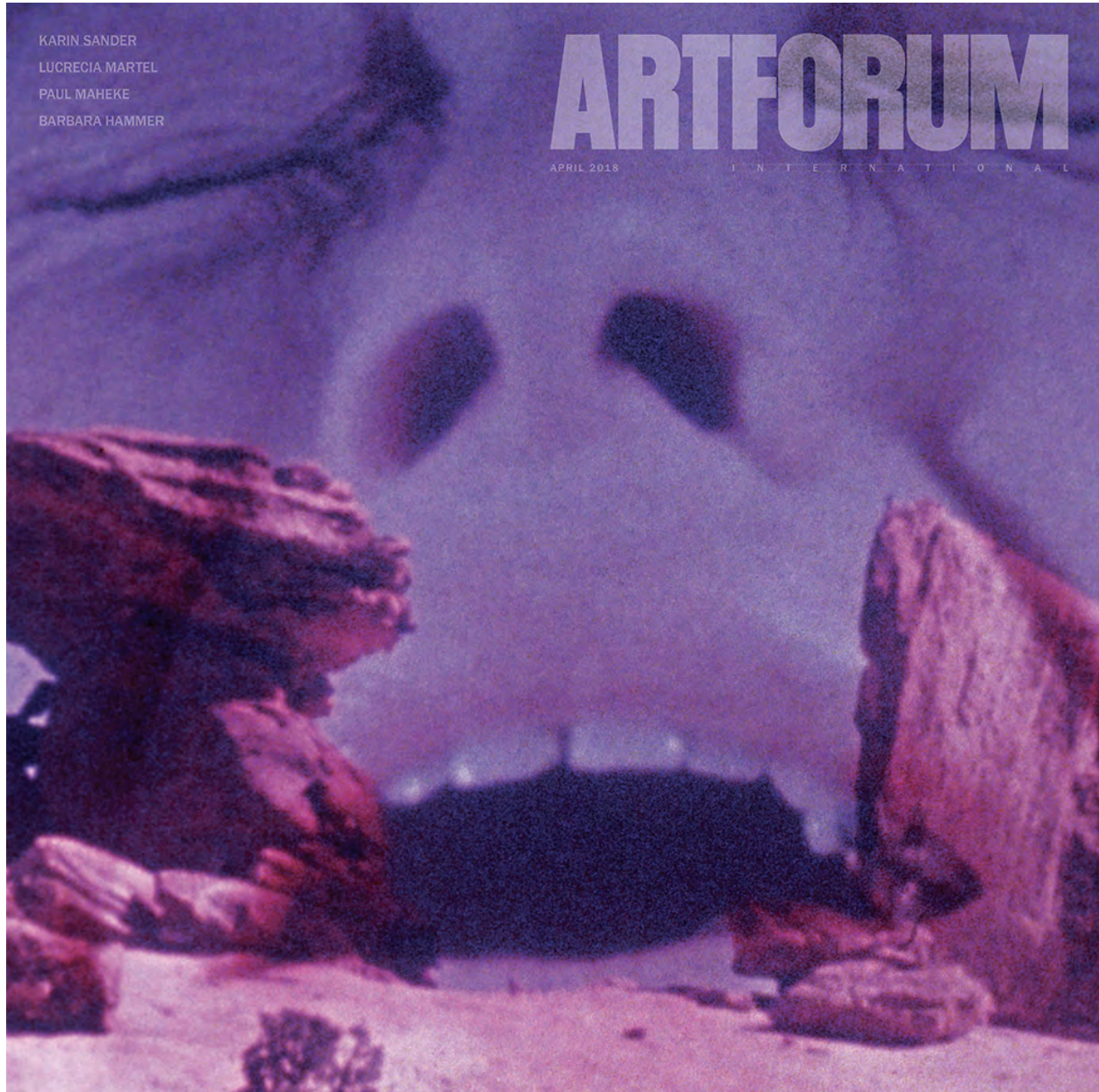
Cover: Barbara Hammer, Multiple Orgasm , 1976, 16 mm transferred to digital video, color, silent, 5 minutes 32 seconds