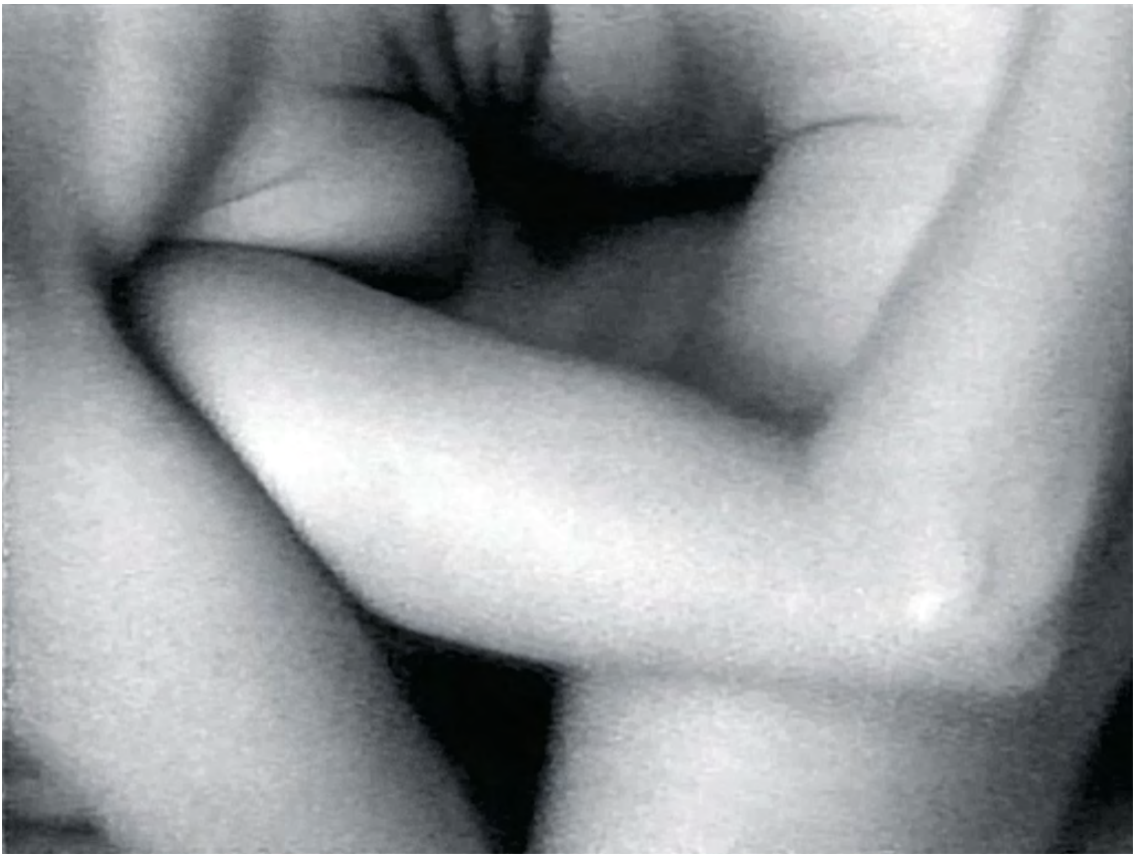
Still from Barbara Hammer and Max Almy's Superdyke Meets Madame X , 1975, video, black-and-white, sound, 20 minutes 32 seconds.