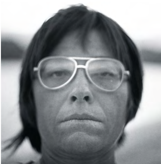
Barbara Hammer, Self-Portrait, Baja California , 1974 (detail), 2017, gelatin silver print, 6 × 4"

TWO THOUSAND SEVENTEEN was a milestone year for the irrepressible Barbara Hammer. In October, the seventy-eight-year-old pioneer of experimental queer cinema, who has produced almost ninety films over the course of her five-decade career, was the “first living lesbian” to receive a retrospective at the Leslie-Lohman Museum of Gay and Lesbian Art in New York. Titled “Evidentiary Bodies,” the exhibition was a testament to the singular combination of sincerity and irreverent humor that characterizes her sex-positive feminism. Featuring an impressive range of films and videos, early drawings, collages, and rarely seen installations, the show revealed how consistently Hammer has explored perception and pleasure, lesbian sexuality, queer invisibility, aging, and illness. In conjunction with the exhibition, Hammer screened newly restored prints of her 16-mm works at the New York Film Festival, Anthology Film Archives, Metrograph, and the Museum of the Moving Image.