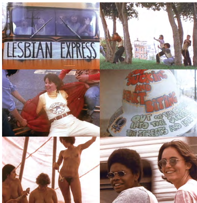
Six stills from Barbara Hammer's Superdyke , 1975, 16 mm transferred to digital video, color, sound, 17 minutes 32 seconds

At other times, she draws us close simply by talking to the people around her. She is as relaxed with a microphone as she is with a camera in hand, and in her films dialogue is never stiff or strained; on the contrary, it is exuberant, confessional, immediate, sensual, fluid. After a screening at EAI last November, I was struck by how Hammer worked the crowd with the skill of a natural performer. She took some questions, answered them thoughtfully and honestly, and then approached a member of the audience. “What are you thinking about?” she asked with a broad smile, gently holding the microphone up to the surprised woman’s face. Asking a viewer how the film made her feel was a simple but radical gesture that upended the hierarchy of guest and audience. The effect of the gesture now, when communication can feel so loaded, when we are experiencing a collective outpouring of personal stories but also seem uncertain about what is and is not acceptable to say, is liberating.