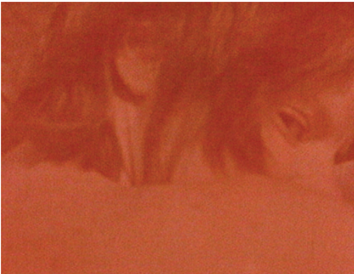
Still from Barbara Hammer's Dyketactics , 1974, 16 mm transferred to digital video, color, sound, 4 minutes

Although she's long been a radical force, institutional recognition of her work has been slow in coming: The Museum of Modern Art in New York held a retrospective screening series in 2010, followed by another in 2012 at Tate Modern in London, but the very public embrace of Hammer in 2017 was on a scale finally in accord with her contributions. It called to mind a question Carolee Schneemann once pointedly asked about her own lack of art-world success: "Was I just a little too early? Or is it because my body of work explores a self-contained, self-defined, pleasured, female-identified erotic integration?" Like Schneemann, Hammer is a woman who uses her own body to create radically sexualized art. Critics, particularly poststructuralist critics of the 1980s, were quick to label Hammer's work "essentialist," arguing that her depictions of women-only groups communing naked in nature reduced female identity to the physical body and upheld the notion that the differences between men and women were biologically determined and genetically defined, as opposed to shaped by social constructions. Ironically, both Hammer and Schneemann, who recently