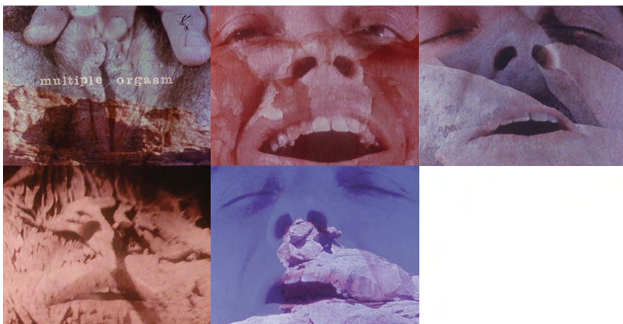
Five stills from Barbara Hammer's Multiple Orgasm , 1976, 16 mm transferred to digital video, color, silent, 5 minutes 32 seconds.