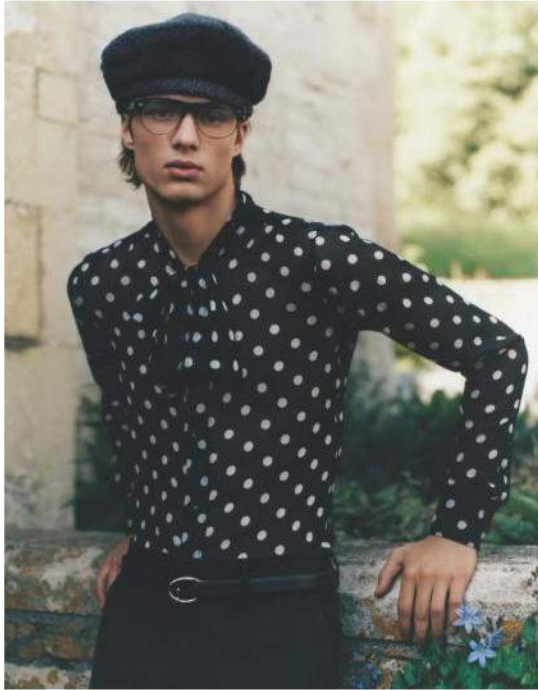
SHIRT, £500; TROUSERS, £495, BOTH BY SAINT LAURENT BY HEDI SLIMANE. BERET, £225, BY WILLIAM CHAMBERS MILLINERY. GLASSES, £189, BY GUCCI. BELT, £240, BY LANVIN. SEE PAGE 214