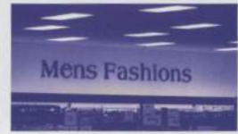
Above Mall of America, 2009