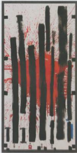
FILMTRACT NO. 1, 2015

The choice of ordinary materials is simply a fascination that I share with artists like Martin Kippenberger, who have used the most banal objects to get away from the exclusivity of art. So in my current show, this is manifested in the form of metal wall vitrines illuminated by fluorescent lights that contain jammed window blinds and toilet seat rugs, business ties, and a grey pair of denim jeans on a denim canvas. These denim objects reflect on social interactions within the art world and employ an object – in this