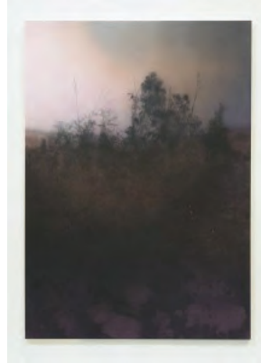
7 Sayre Gomez, Untitled Painting, II , 2014.