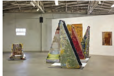
2 View of JPW3's "32 Leaves, I Don't The Face of Smoke," Night Gallery, Los Angeles, 2014.