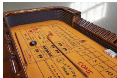
4 JPW3, ZZ Craps , 2014.